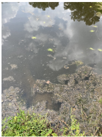
Noted Image 1

Removed trash from the system and treated terrestrial weeds, woody vegetation, and filamentous algae. Noted image 1 shows an additional inlet.