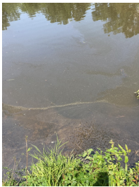
Noted Image 1

Removed trash from the system and treated terrestrial weeds and woody vegetation. Noted image 1 shows a submerged inlet.