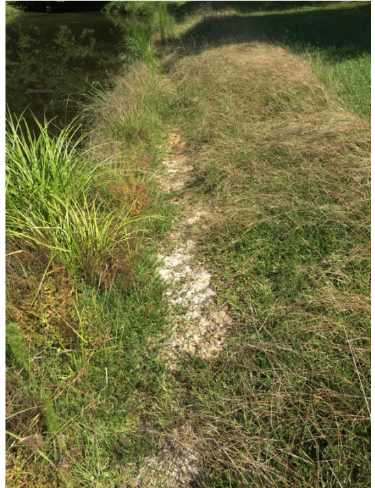
Noted Image 2