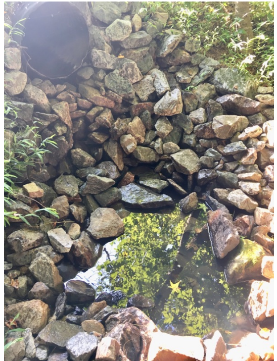
Noted Image 3