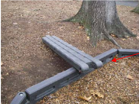
Loose rim piece