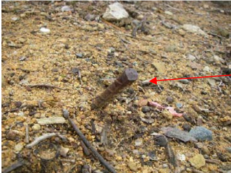
Sample – exposed re-bar (several in same area)