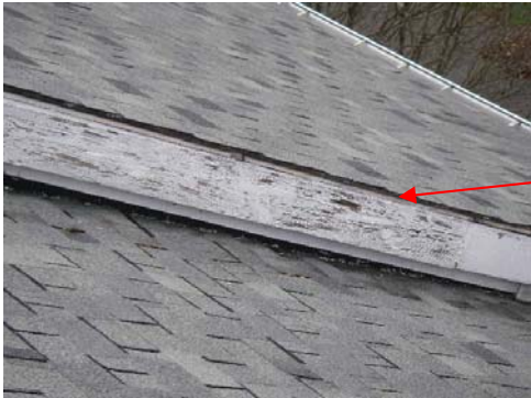
Sample – rake trim left out of the most recent painting