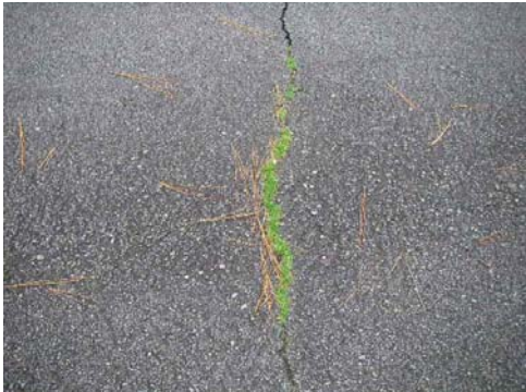
Sample – weed killing/crack to be sealed