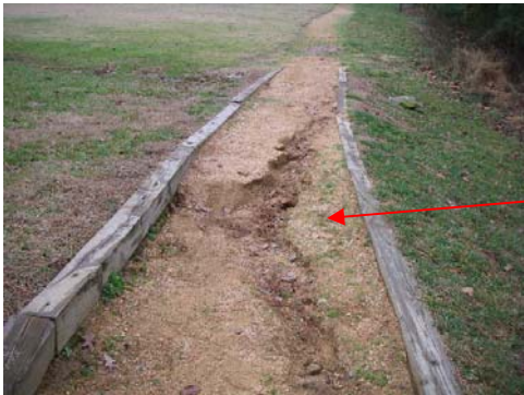
Sample – trail erosion