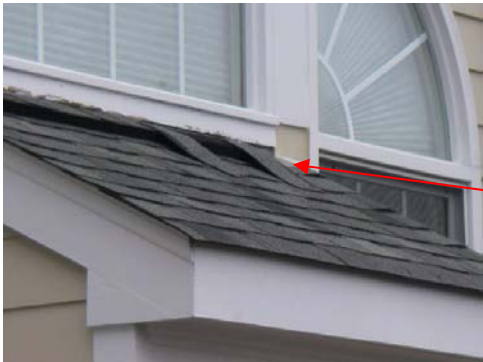
Sample – roof repairs: Loose shingle Missing shingle