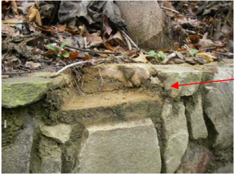
Samples: Missing stones Loose stones