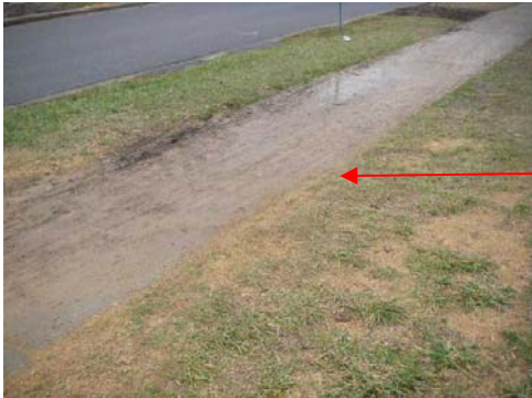
Erosion deposited on sidewalk